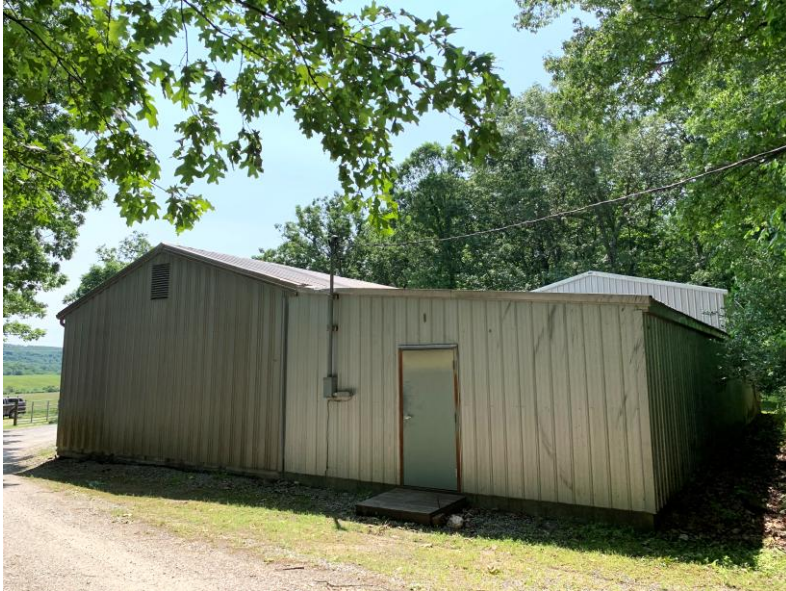
VIEW TO THE WEST