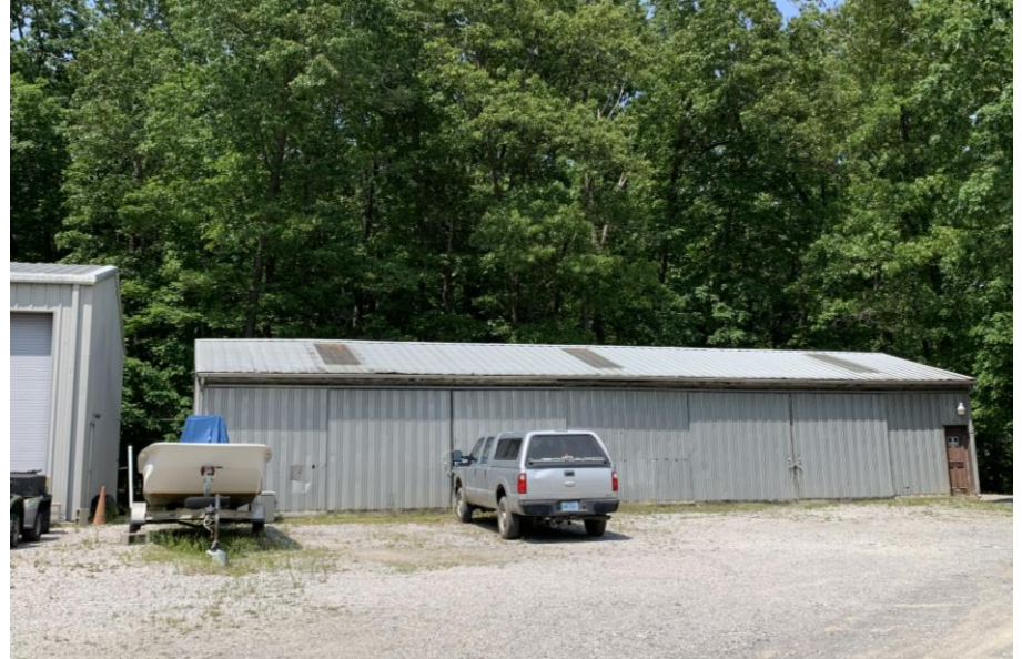
VIEW TO THE NORTH